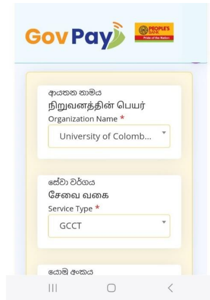
Figure 2: GCCT